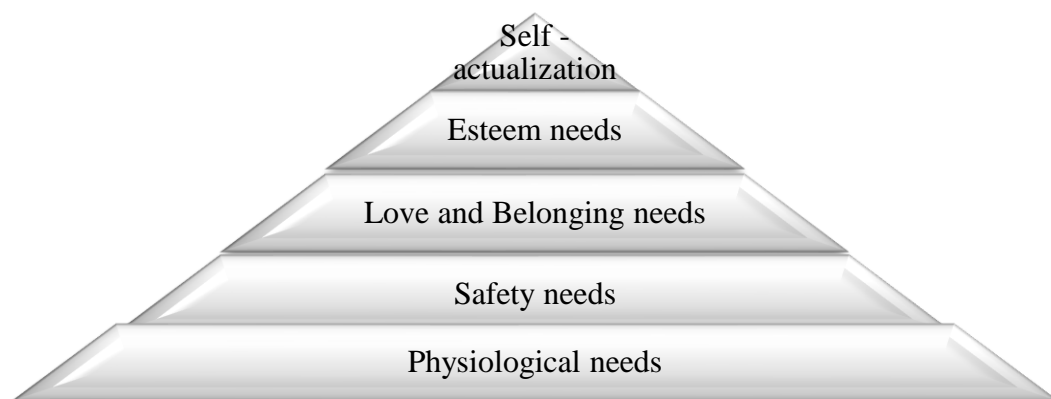
Figure 2.1. Maslow's Hierarchy of Needs

These basic goals are related to each other, being arranged in a hierarchy of prepotency. This means that the most proponent goal will monopolize consciousness and will tend of itself to organize the recruitment of the various capacities of the organism.